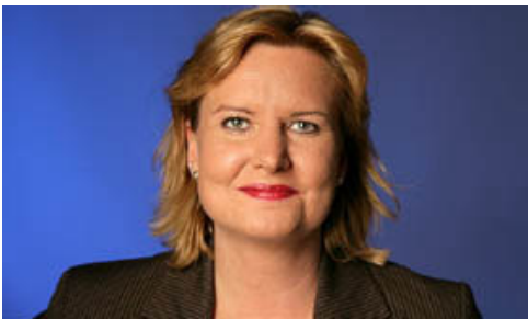
SPD Candidate Eva Högl, who took time to see the ASGP party on Saturday morning